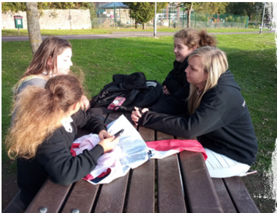
Youth Unlimited deliver outreach youth work at Lyngford Park, where many young people from Taunton spend their spare time

W e support projects across Somerset that help to transform lives, improve social mobility and provide life-changing opportunities that remove barriers to help both children and adults reach their potential.