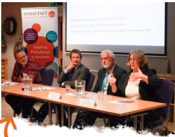
The Hidden Somerset: Homelessness panel event, which leveraged funding leading to the creation of a new fund to help local homeless people furnish their homes

Our Hidden Somerset: Homelessness report has already leveraged funding which led to the creation of The Somerset Move-In Fund (launched in September 2020) which will provide grants to local charities to help local homeless people to furnish accommodation, helping them move into independent living. After a hiatus in 2020 during the coronavirus outbreak, we plan to continue our research and highlight new issues through Hidden Somerset from spring 2021.