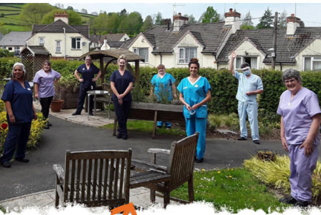
Volunteers at Taunton Scrubbers made over 10,000 items such as operation gowns and scrubs caps for health care workers

We will need them more than ever in the years to come.