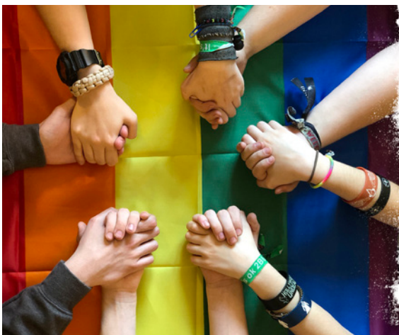
2BU Somerset offers a safe, peer-led space for young people exploring their identity

Our grants also help marginalised and isolated groups, such as young LGBTQ+ people. Acceptance is crucial to the many young people who are coming to terms with their identity, and we have awarded grants to 2BU Somerset to deliver their LGBTQ+ peer led support to help reduce isolation, improve mental health and give young people across the county a safe space to open up and be themselves.