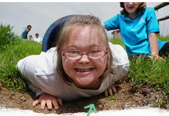
Ups and Downs Southwest offers support to families of children with Down Syndrome

In their Women's Centre in Bridgwater, The Nelson Trust supports vulnerable women and girls with multiple and complex needs with practical and emotional support